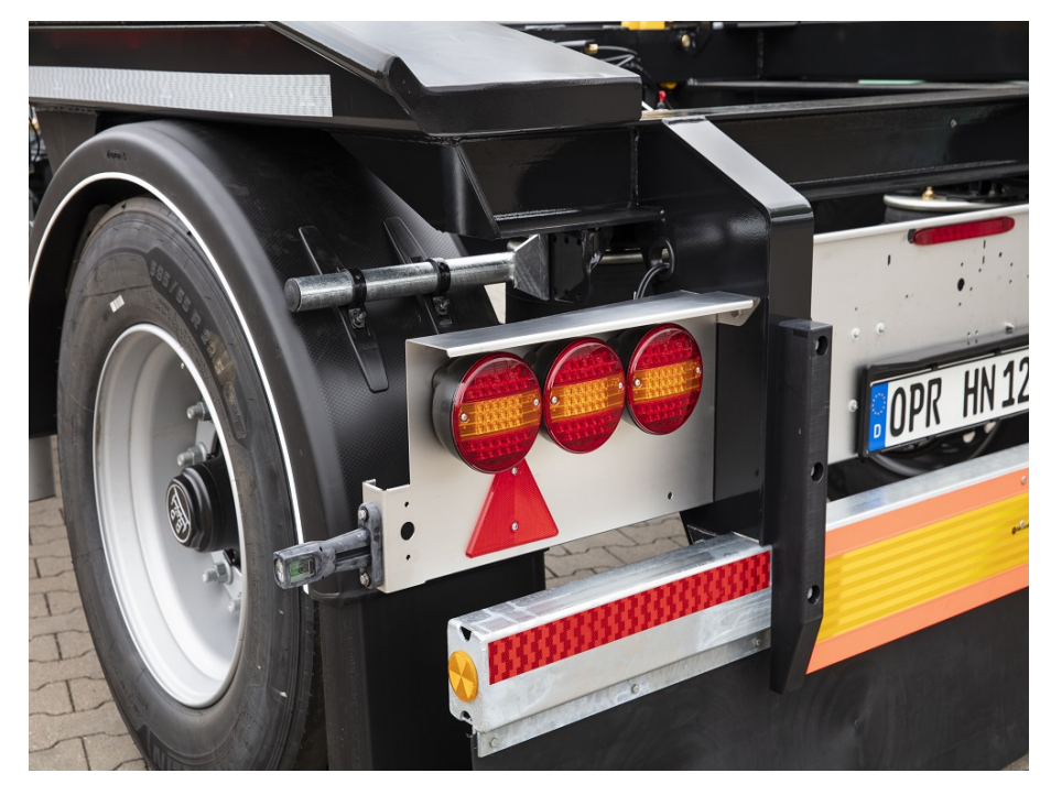
OPTIONAL: 3 LED Rundleuchten