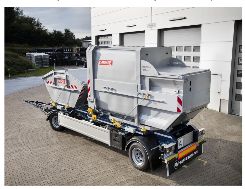
Vario Carrier für zwei Absetzbehälter mit Mulde und Müllpresse