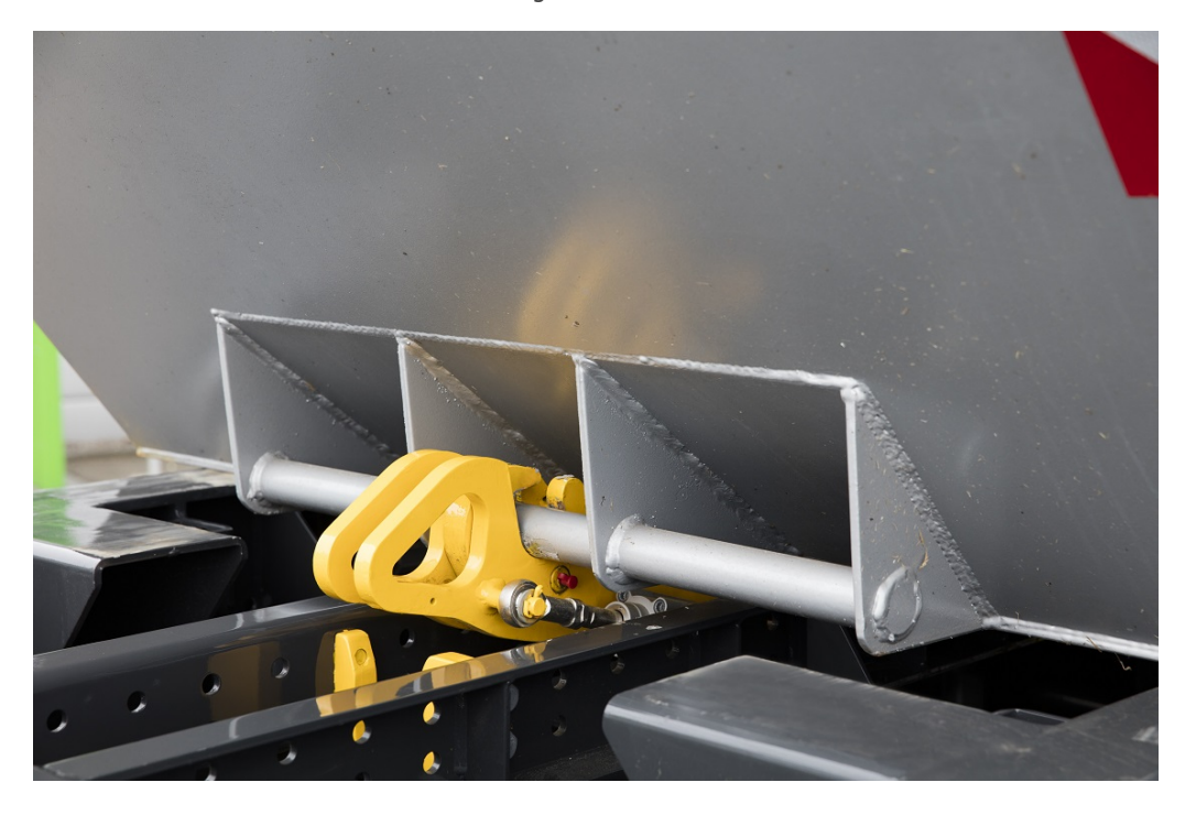
OPTIONAL: Kettenlose Ladungssicherung Multi-Fix