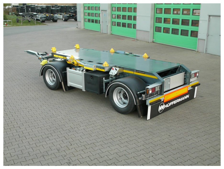
OPTIONAL: Für einen Absetzbehälter mit geschlossenem Boden