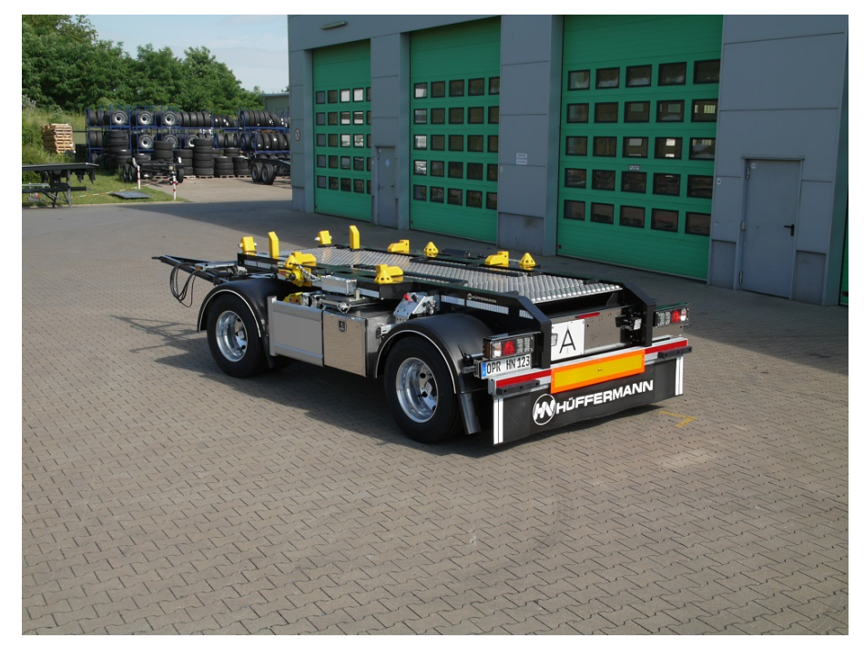
Sonderausstattung für einen Absetzbehälter mit elegance edition, SafetyFix und Boden für Müllpressen