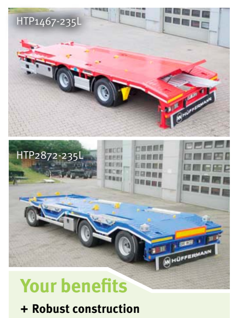
+ Flexible use

Special version with steel or non-slip floor